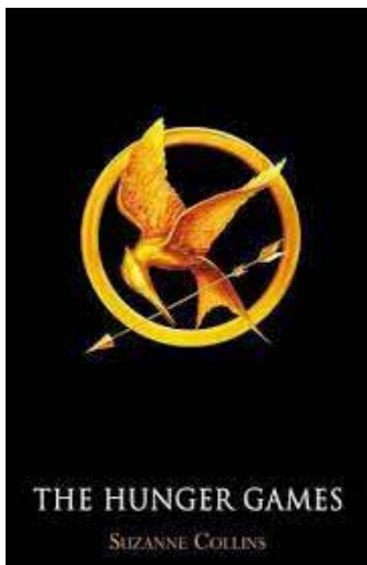
The Hunger Games by Suzanne Collins