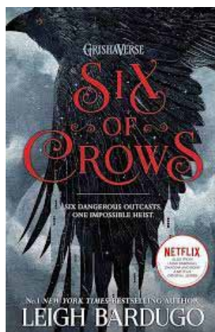
Six of Crows by Leigh Bardugo

trade "entries" in the Games for food vouchers, which increased their chances of being chosen in the Games. Katniss's beloved little sister, Prim, has just turned twelve and is thus eligible for the Games for the first time. Katniss assures Prim she will not be picked; however, Prim is indeed selected. Knowing Prim has little chance of survival in the Games, Katniss volunteers as tribute to save her sister. The story then follows Katniss on her adventures during the games.