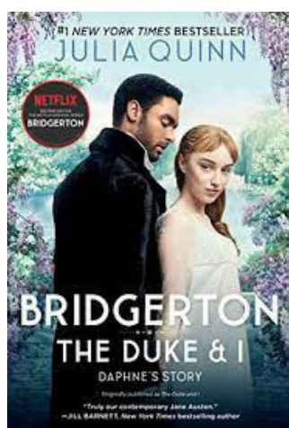
Bridgerton: Duke and I by Julia Quinn

“Look, I never asked to be the son of a Greek god. I was just a normal kid... until I accidentally vaporized my maths teacher.” Percy Jackson is having a bad week. His life has gone from normal to monsters-from-Greek-mythology-randomly-appearing kind of strange. Worse still, the king of the gods thinks Percy has stolen his lightning bolt - and it seems making Zeus angry is a very bad idea.