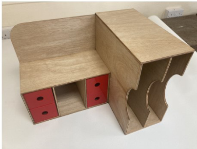
Desk organiser and file storage Harriet