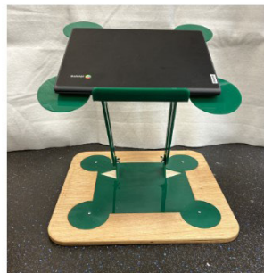
Adjustable laptop stand Archie