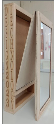
Drop down writing surface with mirror Poppy