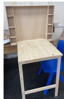
Fold away student desk with storage Beth