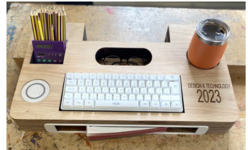
Desk organiser with integrate phone charger and wireless keyboard Lola