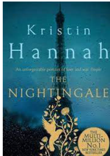
The Nightingale by Kristin Hannah

Moonrise was shortlisted for the Costa Children's Book Award 2017, YA Book Prize 2018 and CBI Book of the Year Award 2018.